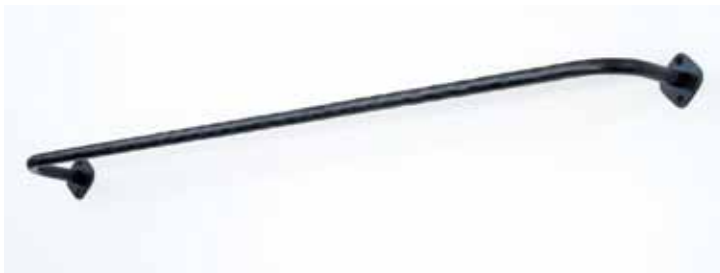
3/4" Dia. Return Curtain Rod