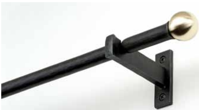
3/4" Coco Bracket with Ball Finial