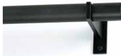
1 1/4" Casa Bracket and 2" Bauhaus Finial w/ Wrought Iron Gray Finish