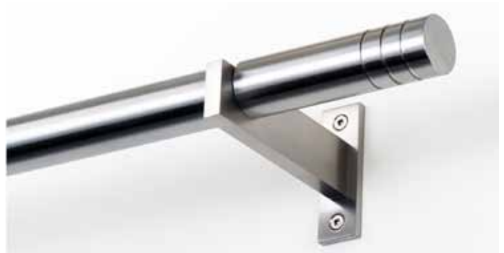
1 1/4" Mira End Bracket with Bauhaus Finial and Chase Detail