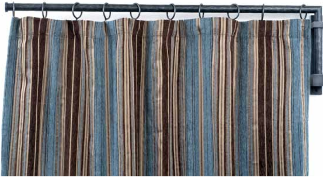
1" Dia. Crane Curtain Rod with Disk Finial