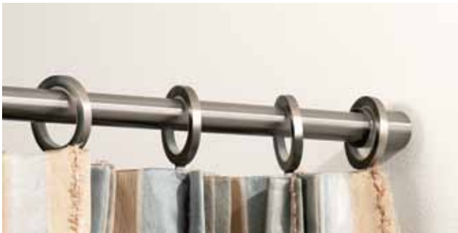
Stainless Steel Socket Bracket and Rod

Our Socket Brackets are engineered for wall to wall installation or to work with all our other hardware lines. Nickel hardware is solid stainless steel and will not rust outdoors or in bathrooms. May be used for shower curtains.