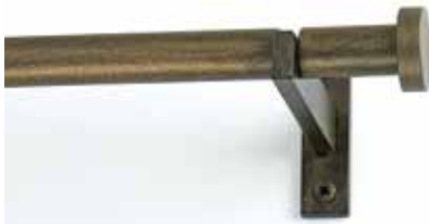
3/4" Casa Bracket and Short Disc Finial w/ Antique Bronze Finish