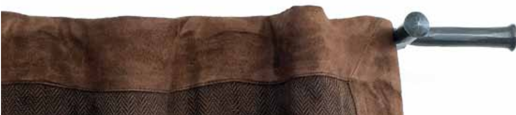
Tommy End Bracket with Flair Finial