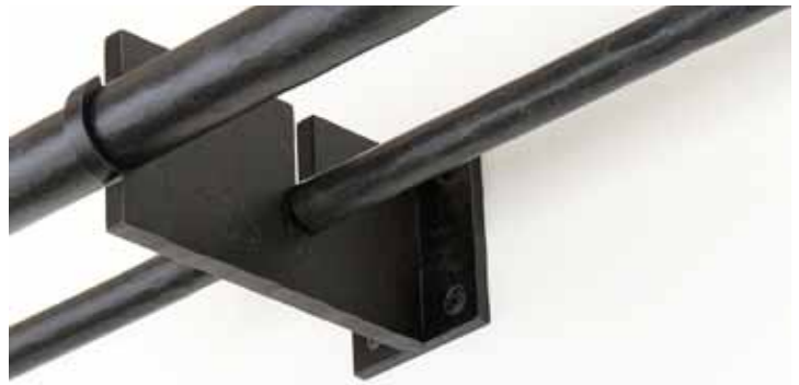
Harrison Grande Double Center Bracket