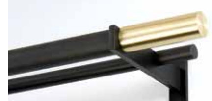
Casa Double Curtain Rod

Our newest hardware line, the Casa Collection features smooth curtain rods in 3/4" and 1 1/4" diameters with minimal brackets. Available with some exciting new finials in brass and iron.