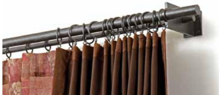
Harrison Double Curtain Rod