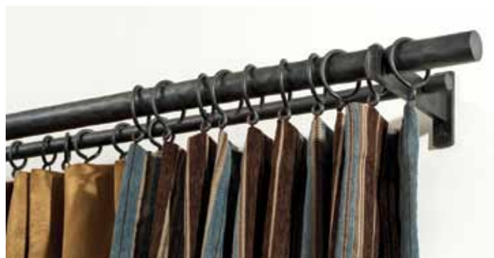
Coco Double Curtain Rod