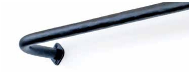
1 1/4" Return Curtain Rod End Detail