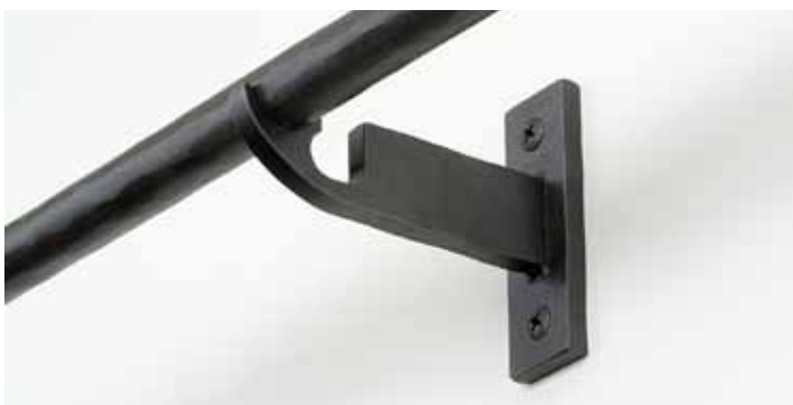
By-Pass Bracket 3/4" #03355, 1 1/4" #03455