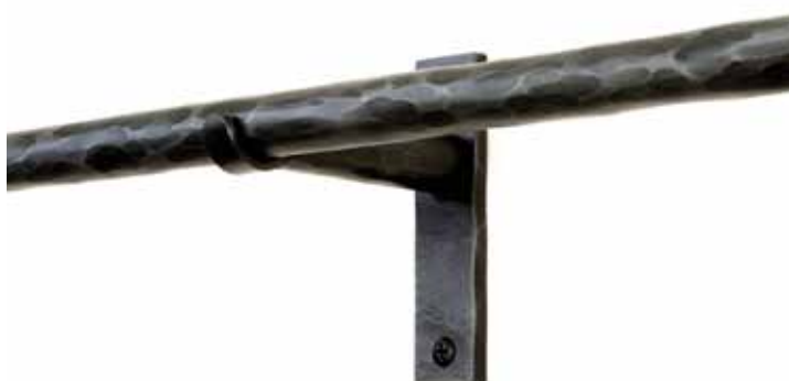
¾" Center Lincoln Bracket