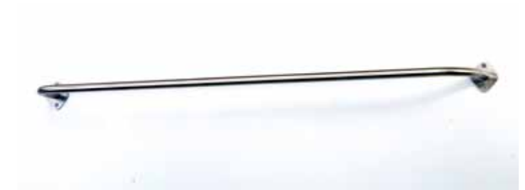
3/4" Dia. Stainless Steel Return Curtain Rod