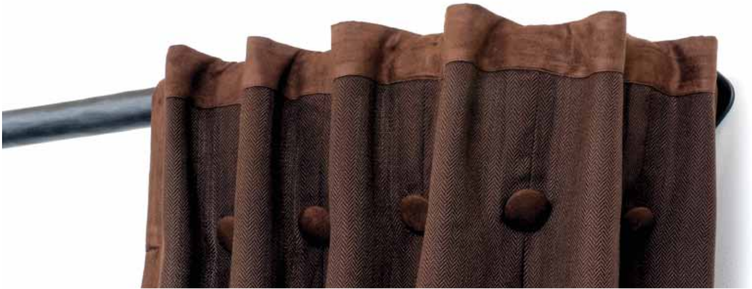
1 1/4" Return Curtain Rod