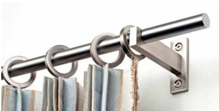
3/4" Mira End Bracket with Bauhaus Finial with Nickel Finish Rings