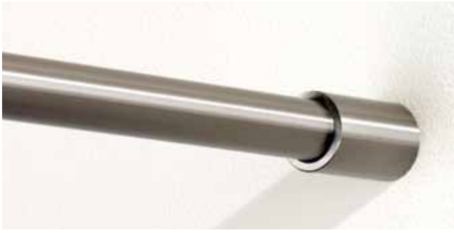
Stainless Steel Socket Bracket and Rod Detail