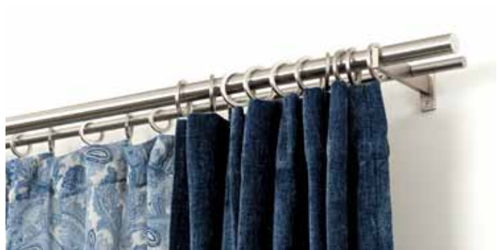
Mira Double End Bracket