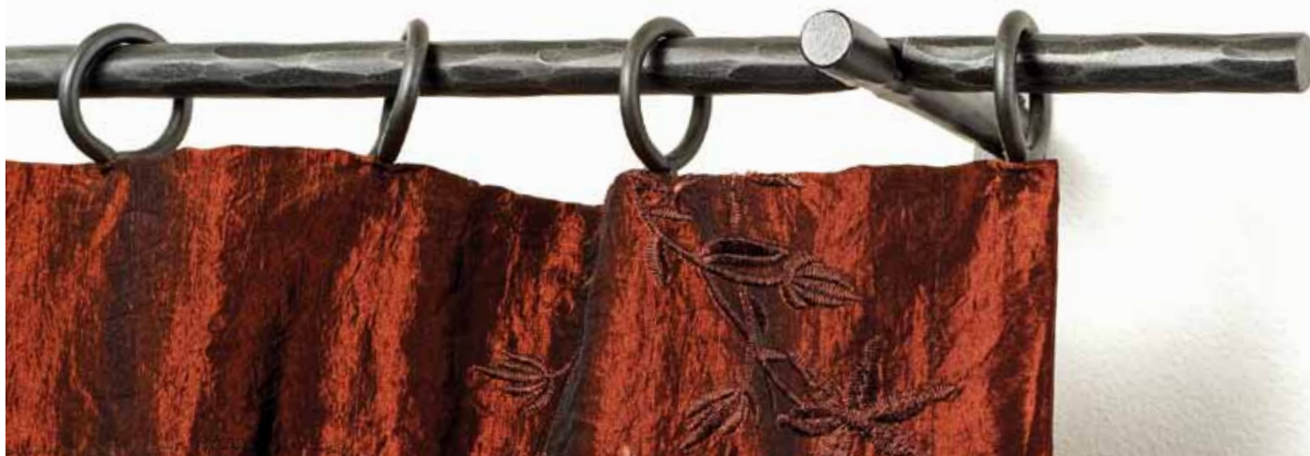
½" Lincoln End Bracket and Finial