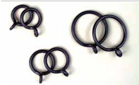
Wrought Iron Curtain Rings