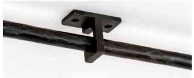
Coco Ceiling Center Bracket