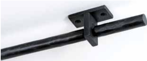
Coco Ceiling Bracket with Bauhaus Finial