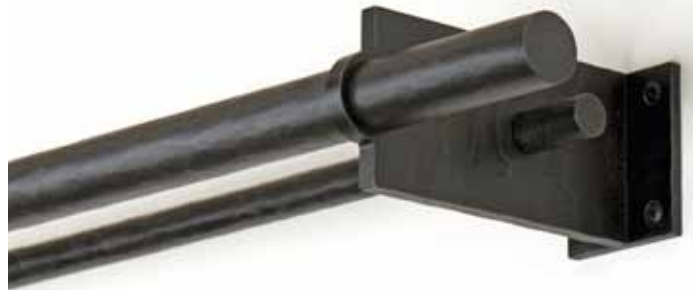
Harrison Grande Double End Bracket