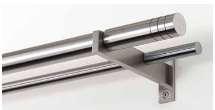
Mira Double End Bracket