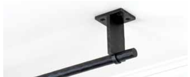
Harrison Petite Ceiling Bracket With Short Finial