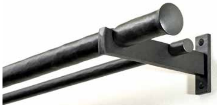
Coco Double Bracket with Flair Finial & Short Bauhaus Finial