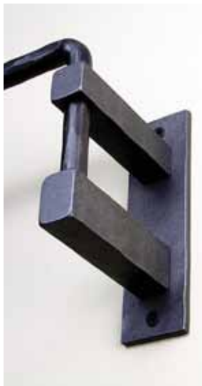
1/2" Dia. Crane Rod 3" Projection