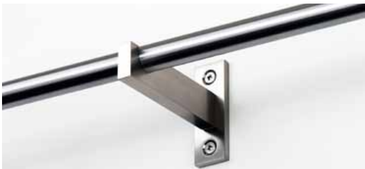
Mira Center Bracket