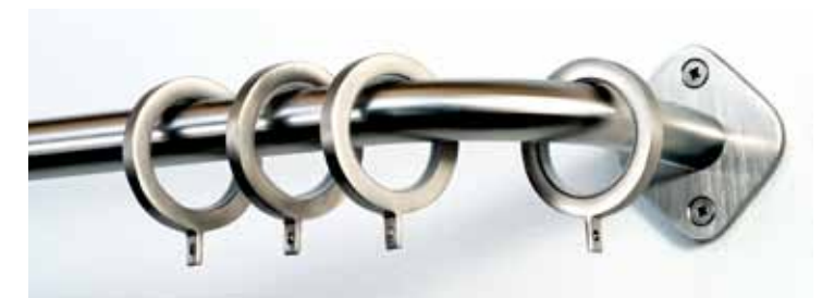
3/4" Dia. Stainless Steel Return Curtain Rod Detail

Our Return Rods are clean and elegant yet sturdy and functional. A minimal curtain rod with no finials, perfect for eliminating light or to conceal window frames. Available in 3/4" and 1 1/4" diameter iron rod, also in 3/4" diameter stainless steel rod.