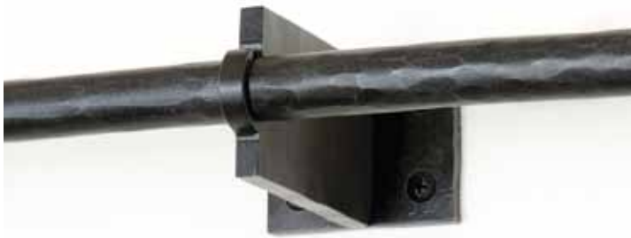
3/4" Harrison Petite Center Bracket