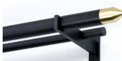
Casa Double Curtain Rod