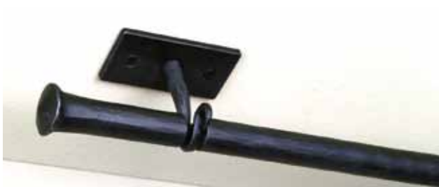
Olivia Ceiling End Bracket with Flair Finial