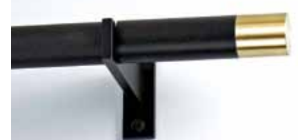
1 1/4" Casa Bracket and Extended Brass Bauhaus Finial w/ Wrought Iron Gray Finish