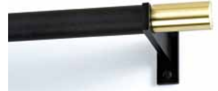
1 1/4" Casa Bracket and 2" Brass Bauhaus Finial w/ Wrought Iron Gray Finish