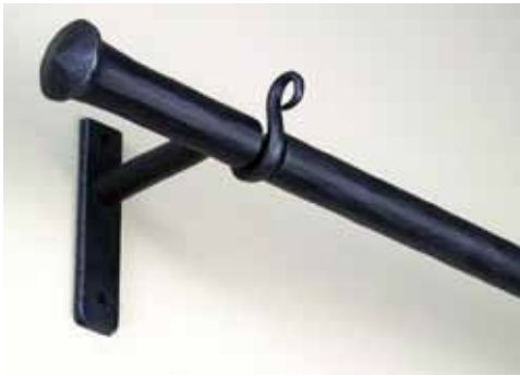
Olivia End Bracket with Flair Finial