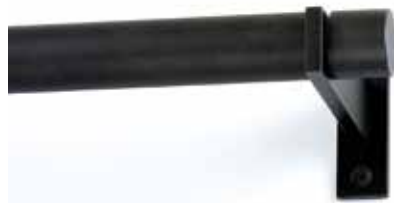
1 1/4" Casa Bracket and 1" Bauhaus Finial w/ Wrought Iron Gray Finish