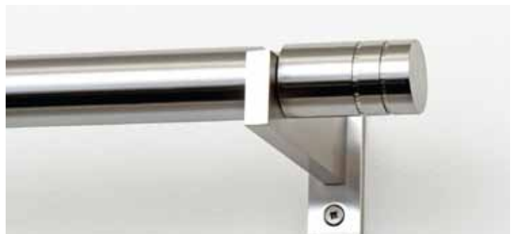
1 1/4" Mira End Bracket with Short Bauhaus Finial and Chase Detail