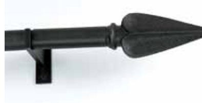
1 1/4" Casa Bracket and Lancea Finial w/ Wrought Iron Gray Finish