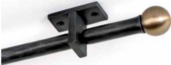
Coco Ceiling Bracket with Ball Finial