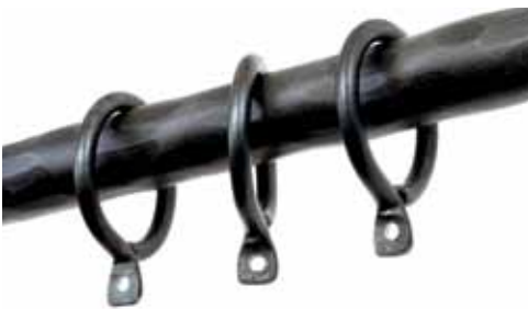
Wrought Iron Curtain Rings