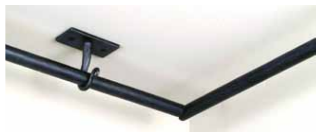
Olivia Ceiling Center Bracket with Rod Hinge

Our company has the most Ceiling Curtain Rod styles. We have standard drop sizes and the ability to make custom drops when you need to clear soffits or other architectural details. Create a vestibule around drafty doors or a simplified installation for bay windows. Dramatic around beds as well as for floor to ceiling drapes.