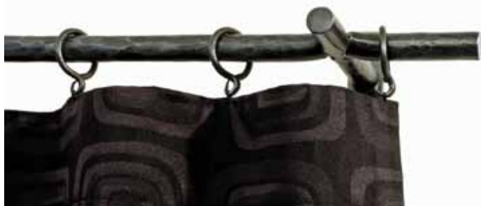
¾" Lincoln End Bracket and Finial

Minimal meets traditional in the Lincoln Hardware line. The links are flattened to keep the rods and brackets on the same plane. All rods are welded to your specified length. Available in Wrought Iron Gray, Bronze or German Silver Finish.