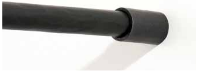
Wrought Iron Socket Bracket and Rod Detail