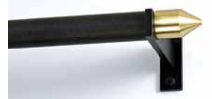
1 1/4" Casa Bracket and Brass Bullet Finial w/Wrought Iron Gray Finish