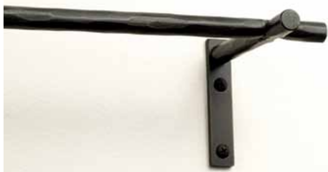
½" Lincoln End Bracket and Short Finial