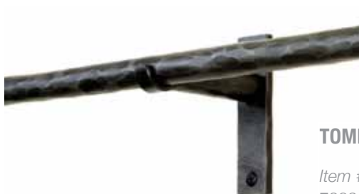
Tommy Center Bracket

Authenticity meets function in our Tommy Hardware line. A hammered nail head finial with matching hammered bracket ends. A flattened link keeps rods and brackets on the same plane. Excellent when you want hardware close to the ceiling or non-intrusive. All rods are welded to your size. Available in 1/2" diameter only.