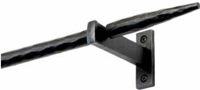
3/4" Coco Bracket with Javelin Finial