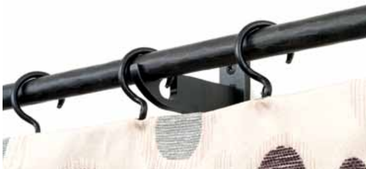
By-Pass Bracket with C Rings