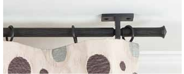
Coco Ceiling Bracket with Flair Finial