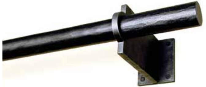
1 1/4" Harrison Grande Bracket with Bauhaus Finial