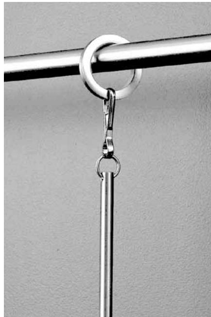
Stainless Steel Wrought Iron Tieback