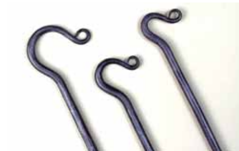
Wrought Iron Rod Batons