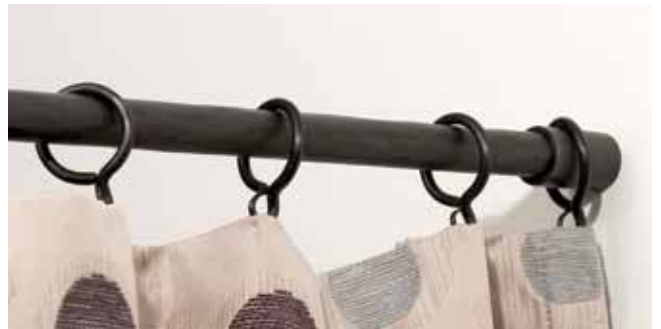
Wrought Iron Socket Bracket and Rod

Our Socket Brackets are engineered for wall to wall installation or to work with all our other hardware lines. Nickel hardware is solid stainless steel and will not rust outdoors or in bathrooms. May be used for shower curtains.