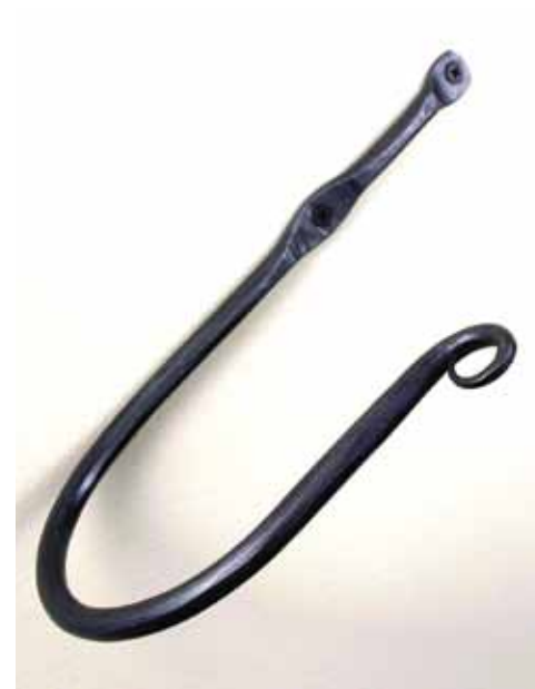
Fixed Wrought Iron Tieback