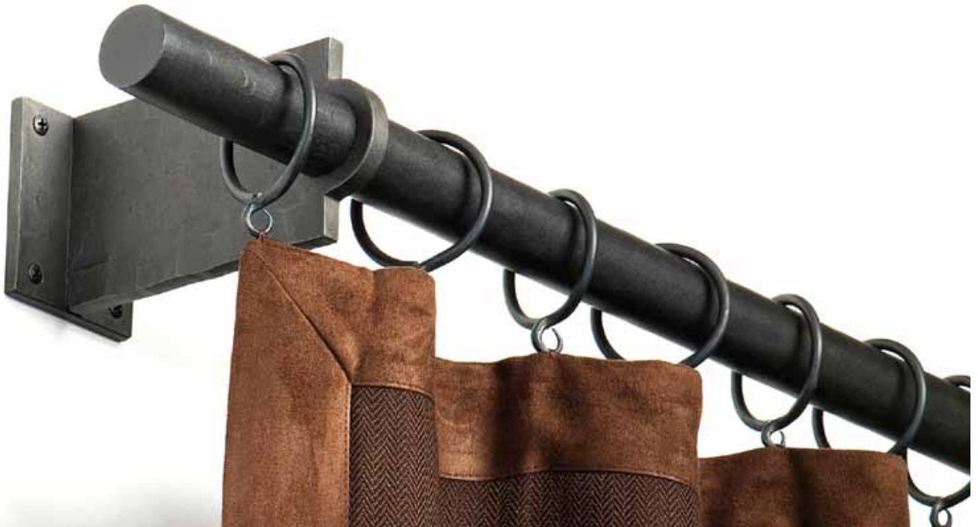
1 1/4" Harrison Grande with Bauhaus Finial

The Harrison Hardware line offers our tradition of expert craftsmanship combined with innovative design. Hand forged heavy walled tubular poles [.120"] with solid finials and brackets comprise this elegant hardware line. All rods are welded to your desired length. Brackets and finials screw together, keeping rods in place.