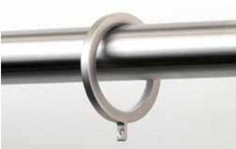
Nickel Finish Curtain Ring