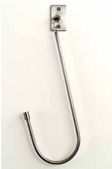
Linked Stainless Steel Tieback