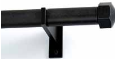
1 1/4" Casa Bracket and Hex Finial w/ Wrought Iron Gray Finish