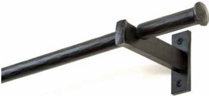
3/4" Coco Bracket with Flair Finial