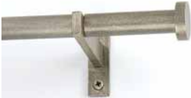
3/4" Casa Bracket and Long Disc Finial w/ German Silver Finish