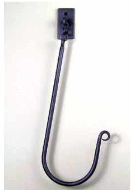
Linked Wrought Iron Tieback