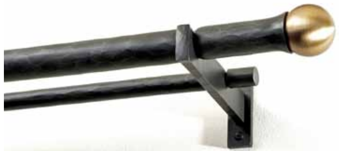
Coco Double Bracket with Ball Finial & Short Bauhaus Finial