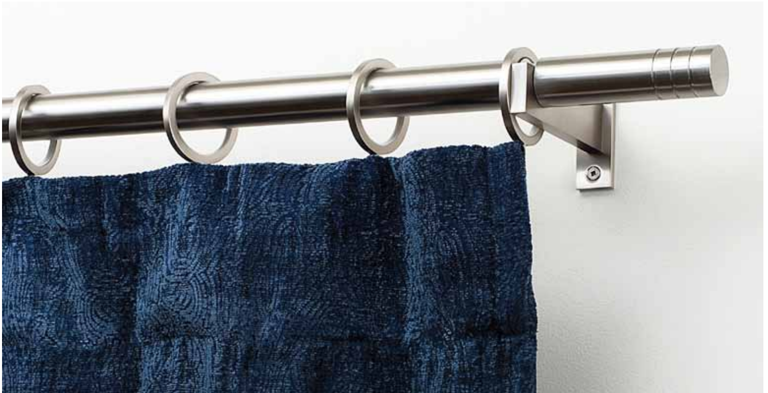
1¼" Mira End Bracket with Bauhaus Finial and Chase Detail

The Mira Hardware features a high quality Nickel finish which makes it a perfect hardware for interiors, outdoors or bathrooms. The Mira rods are heavy walled tubular poles [1/8"]. Rods and finials are made of stainless steel. Brackets are fabricated from solid aluminum with a nickel finish in order to achieve a sturdy but light weight effect. Brackets and finials link together, keeping rods in place without set screws or other fasteners. All rods made to your specified length.