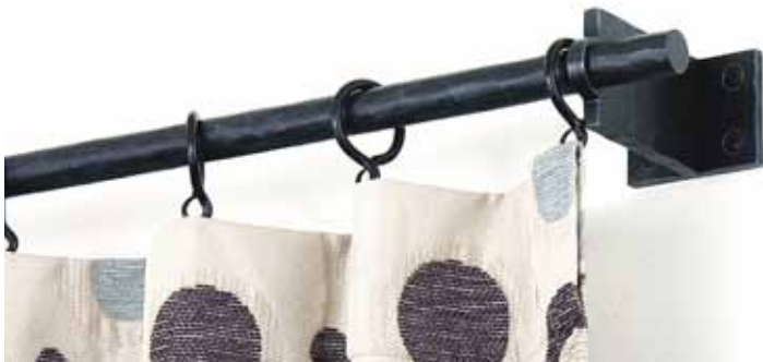
3/4" Harrison Petite Bracket with Short Bauhaus Finial