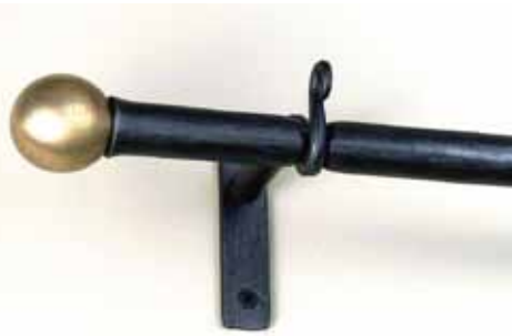
Olivia End Bracket with Ball Finial

Our Olivia Hardware is the most traditional style featuring hand forged solid steel brackets and finials. 1/2" rods are solid, 3/4" and 1 1/4" rods are tubular. Available in Wrought Iron Gray, Bronze or German Silver Finish.