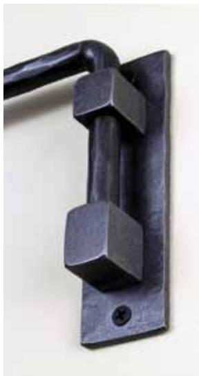
1/2" Dia. Crane Rod 3/4" Projection