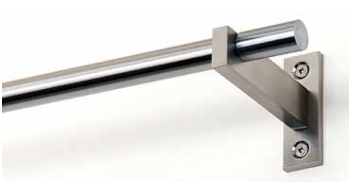
3/4" Mira End Bracket with Short Bauhaus Finial