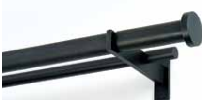
Casa Double Curtain Rod