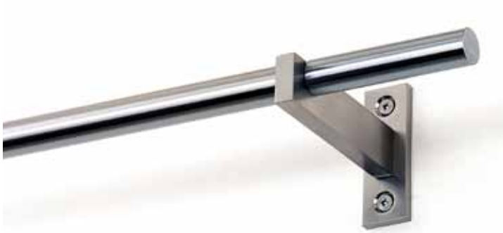
3/4" Mira End Bracket with Bauhaus Finial