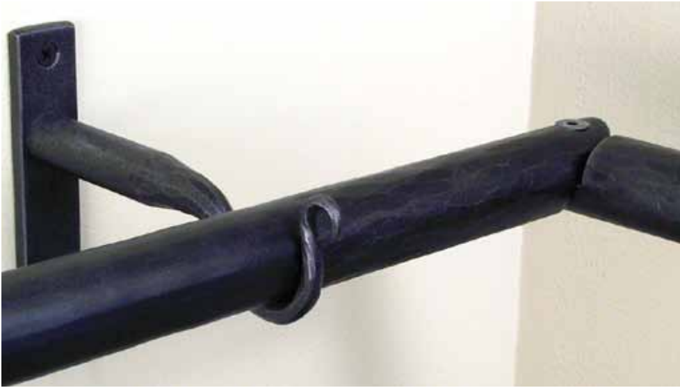
Olivia Center Bracket with Rod Hinge