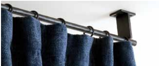
Harrison Petite Ceiling Bracket