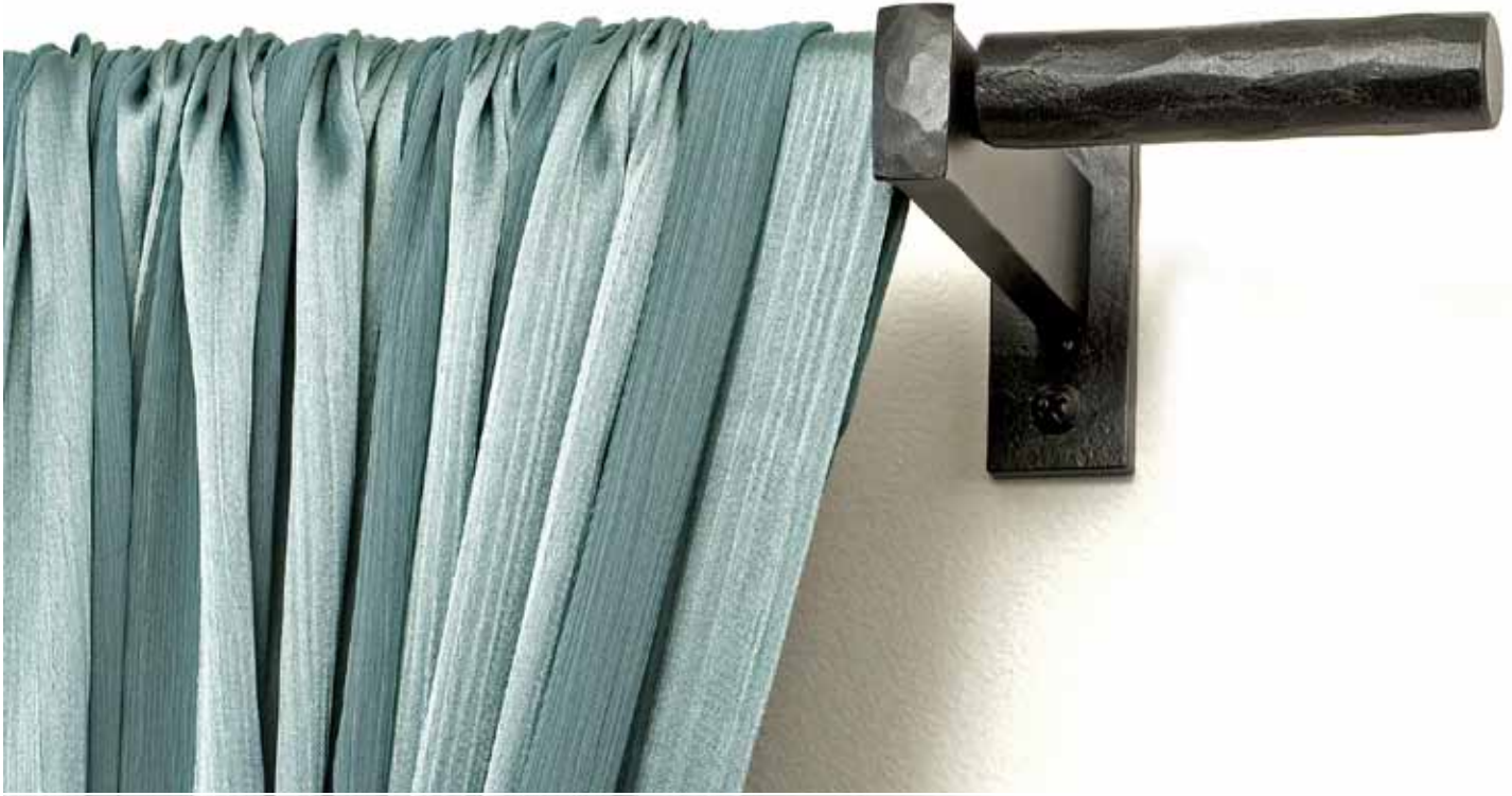
¾ Coco Bracket with Bauhaus Finial

A handsome blend of contemporary and traditional styling allows Coco Hardware to be used in modern to timber frame decor. High quality forged steel brackets with heavy walled tubular poles [.120"] characterize the Coco line. Brackets and finials link together, keeping rods in place without set screws or other fasteners. All rods are made to your specified length.