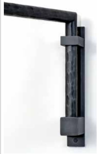
1" Dia. Crane Curtain Rod Detail

Our Crane Rods are designed to operate smoothly, while upholding their reputation as the strongest in the industry. 1" Crane Rods are capable of holding long banners, quilts, tapestries as well as heavy curtains up to 6' wide without end support. 1/2" rods have 3 projections [3/4", 2" and 3"] in order to place the rod in the right position over moldings or when extended out from the wall. Ball finials are included with 1/2" rods only. Available in Wrought Iron Gray, Antique Bronze or German Silver Finish.