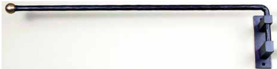
1/2" Dia. Crane Curtain Rod

Our Crane Rods are designed to operate smoothly, while upholding their reputation as the strongest in the industry. 1" Crane Rods are capable of holding long banners, quilts, tapestries as well as heavy curtains up to 6' wide without end support. 1/2" rods have 3 projections [3/4", 2" and 3"] in order to place the rod in the right position over moldings or when extended out from the wall. Ball finials are included with 1/2" rods only. Available in Wrought Iron Gray, Antique Bronze or German Silver Finish.