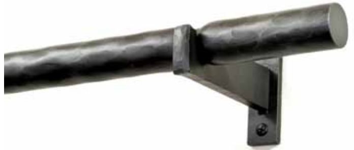
1 1/4" Coco Bracket with Bauhaus Finial