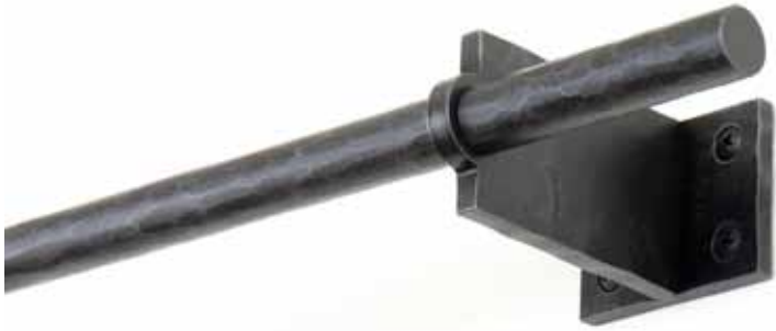
3/4" Harrison Petite Bracket with Bauhaus Finial